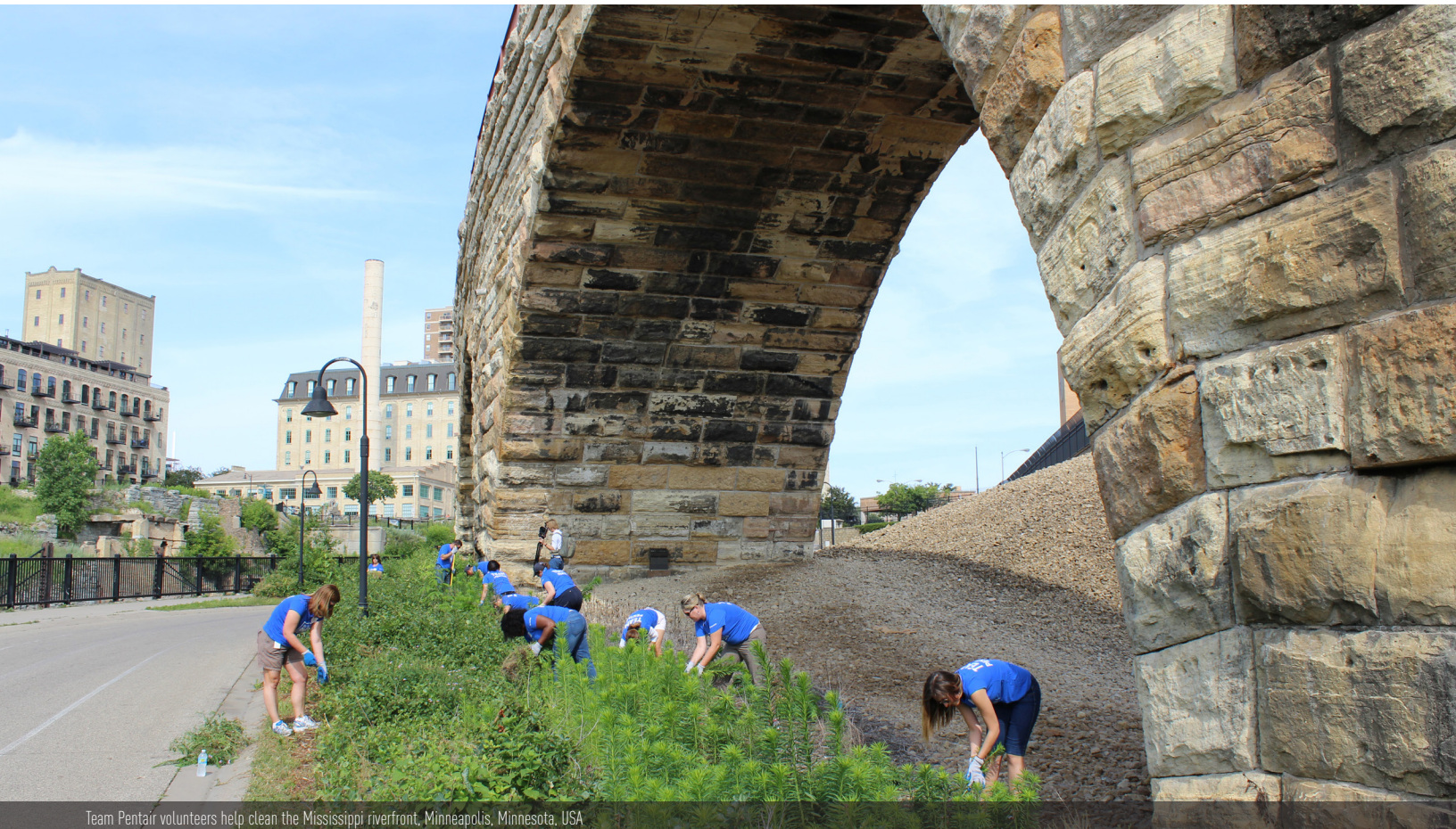
Team Pentair volunteers help clean the Mississippi riverfront, Minneapolis, Minnesota, USA

As an employee of Pentair, you will be asked to sign a commitment statement that you have read and understand the Pentair Code of Business Conduct and Ethics and that you will act in full compliance with the Code.