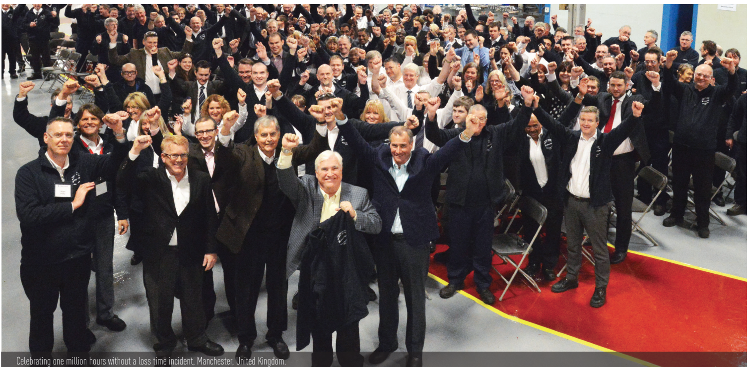
Celebrating one million hours without a loss time incident, Manchester, United Kingdom.

A: No threats against our company or an employee should be ignored or go unreported. If you feel that your colleague is making threats, or if you witness any violent behavior, you should Speak Up. Contact your local Environmental, Health & Safety team or Human Resources. If those people are unavailable or non-responsive, reach out to a contact listed within the Speak Up Resources section . If the situation escalates and involves an immediate or urgent threat of harm, you should contact local law enforcement officials.