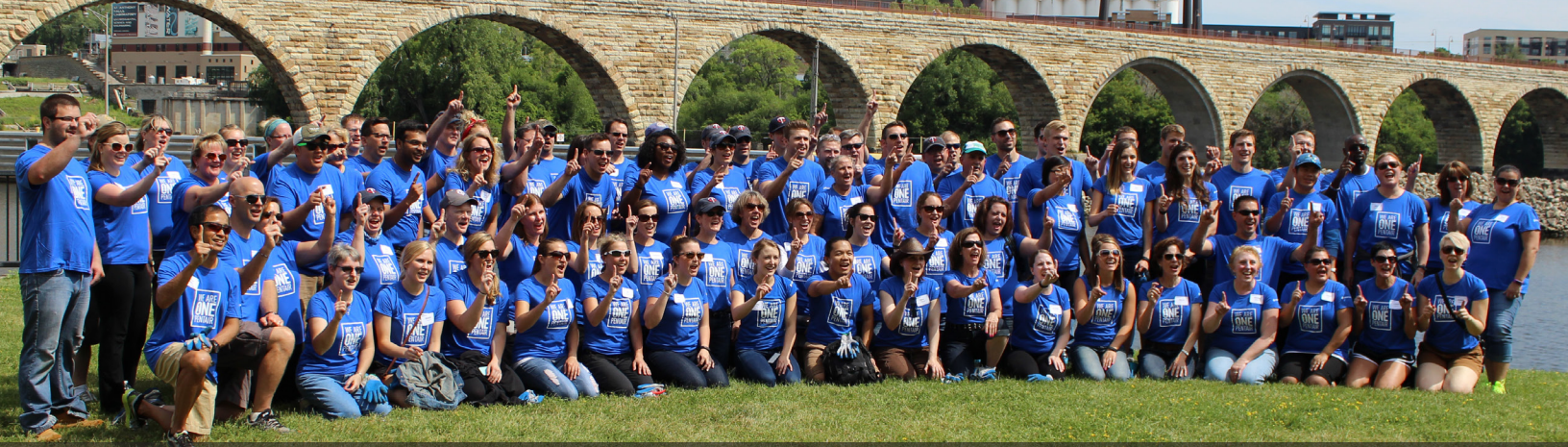
Team Pentair Day, Minneapolis, Minnesota, USA.