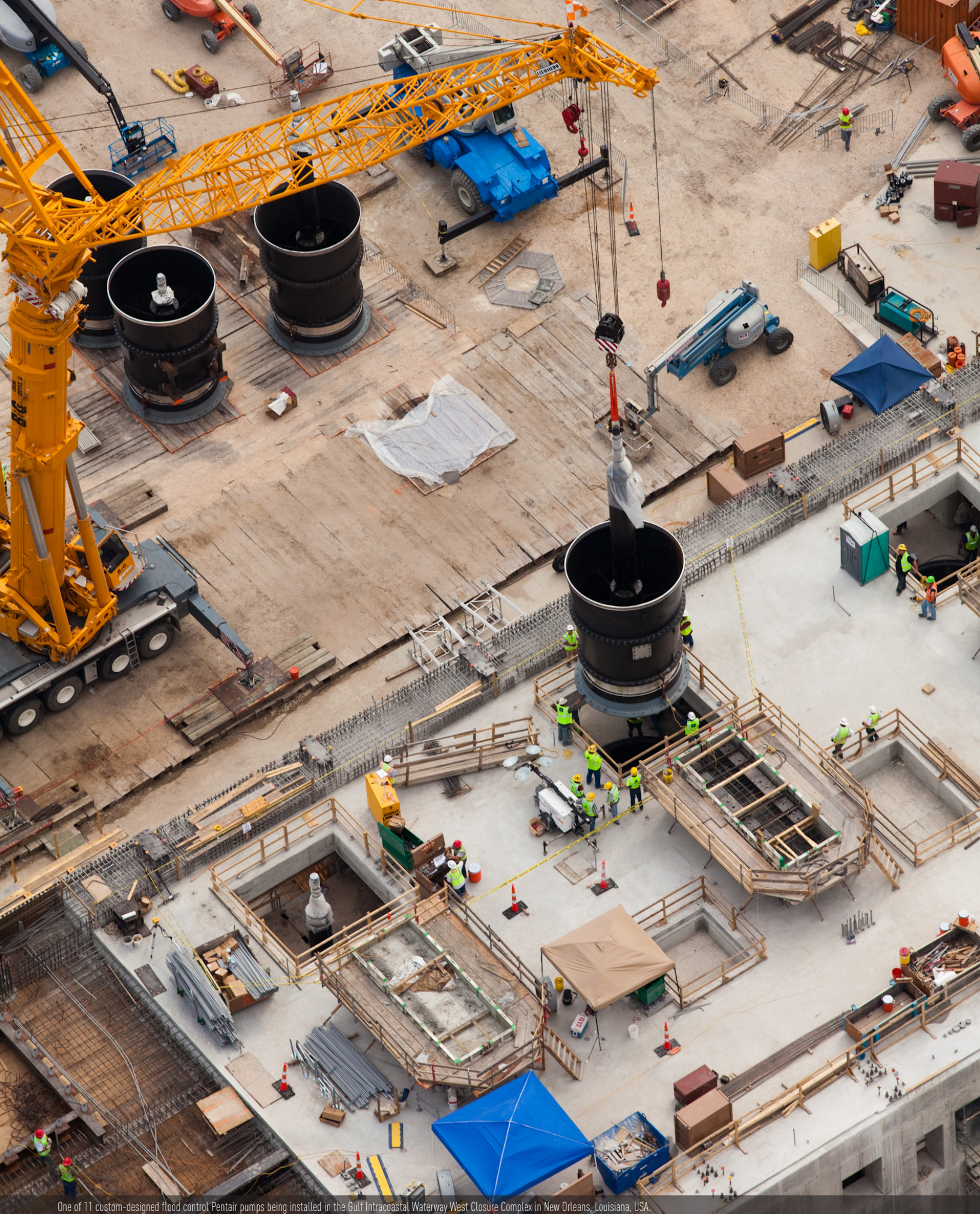
One of 11 custom-designed flood control Pentair pumps being installed in the Gulf Intracoastal Waterway West Closure Complex in New Orleans, Louisiana, USA.