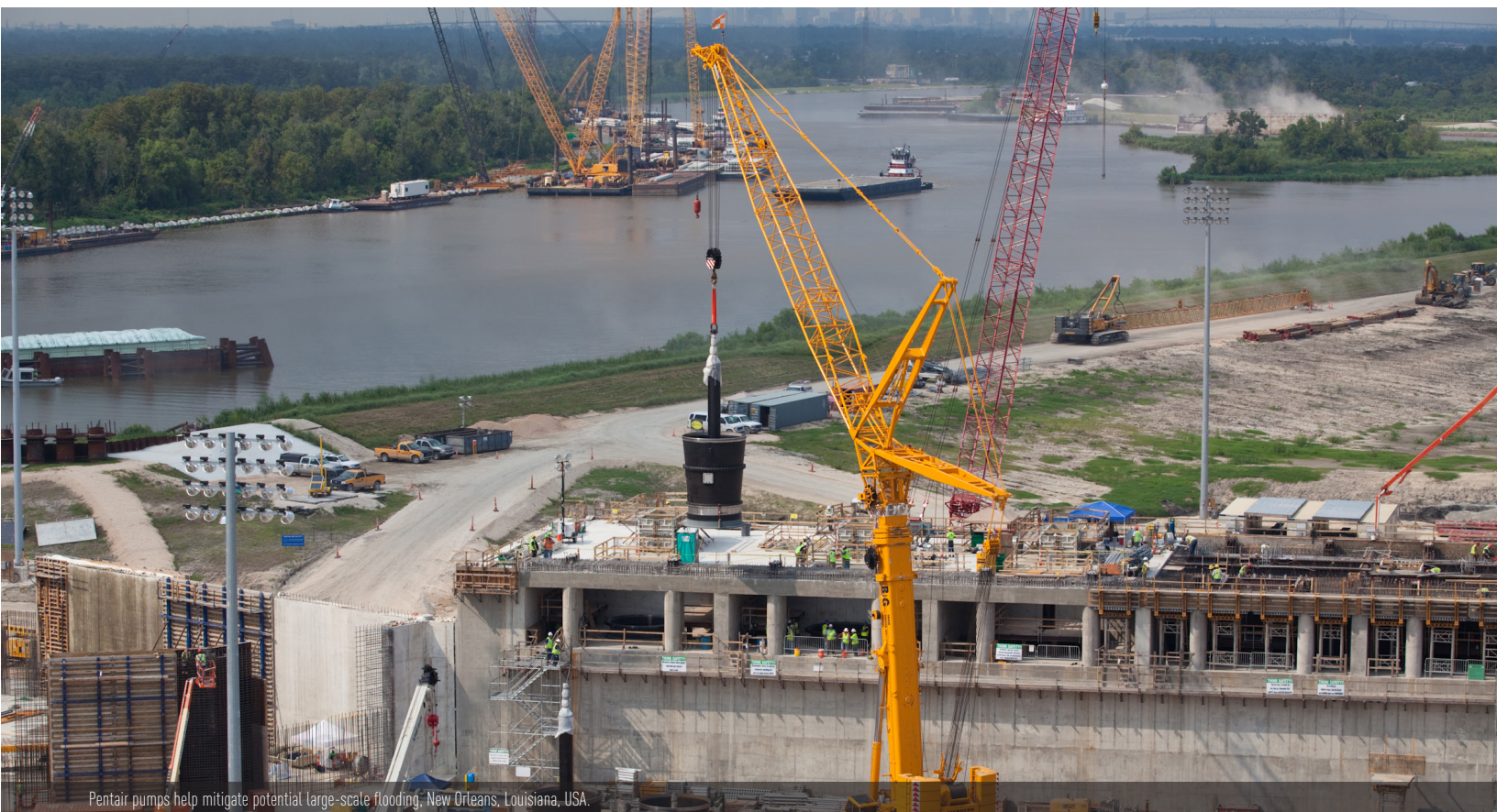
Pentair pumps help mitigate potential large-scale flooding, New Orleans, Louisiana, USA.

A: Whereas the plant visit may be acceptable, the trip to Disney World is not permitted and is a form of bribery. Under no circumstance should we pay for a customer’s family members to travel with him or her or for a trip to Disney World or any other destination unrelated to Pentair’s business.